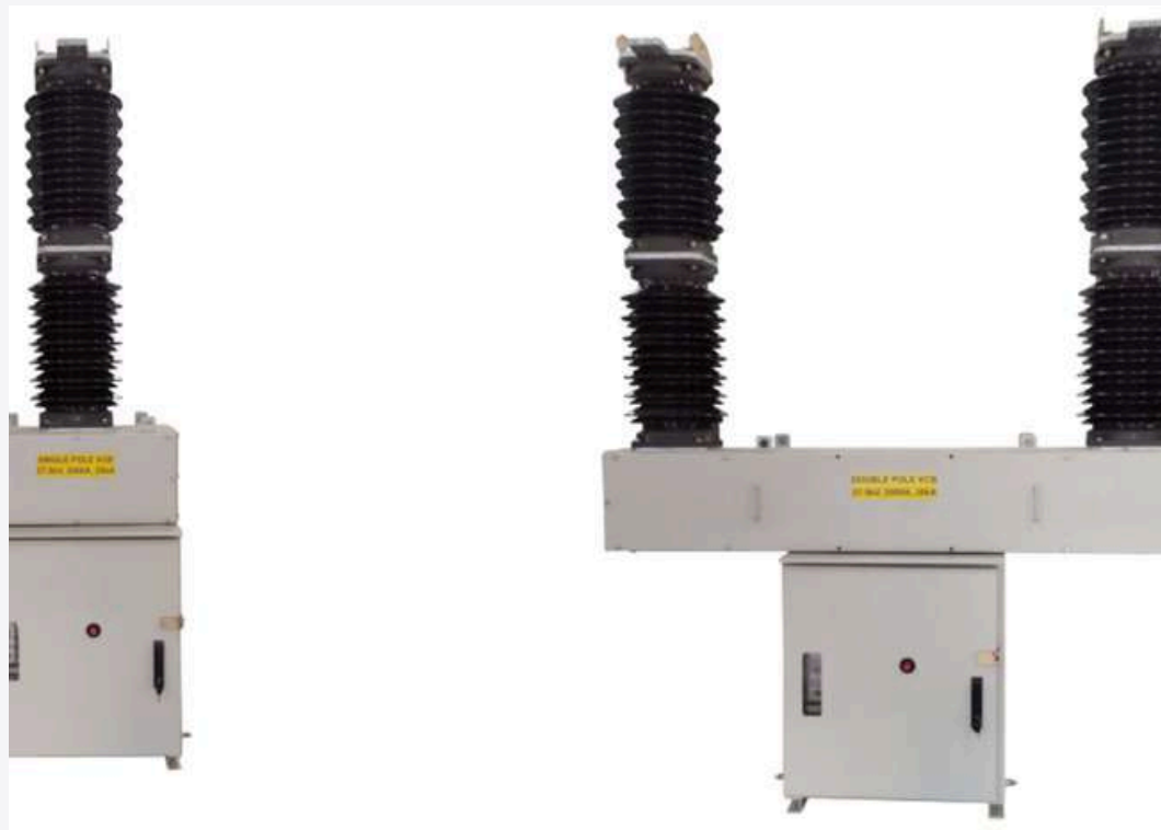
Single Pole VCB Double Pole VCB