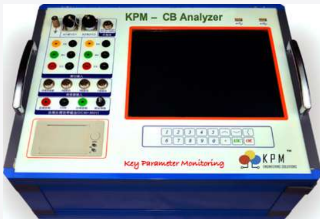
Circuit Breaker Analyzer