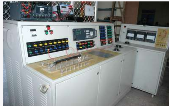
High Voltage Test